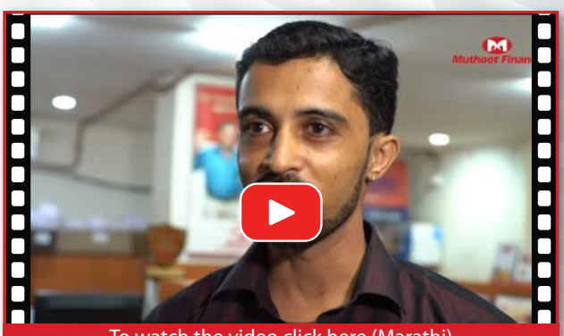
To watch the video click here (Marathi)